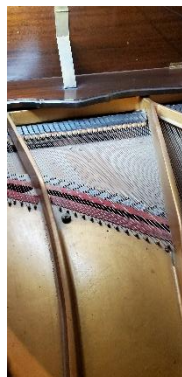
The piano gets a cleaning!