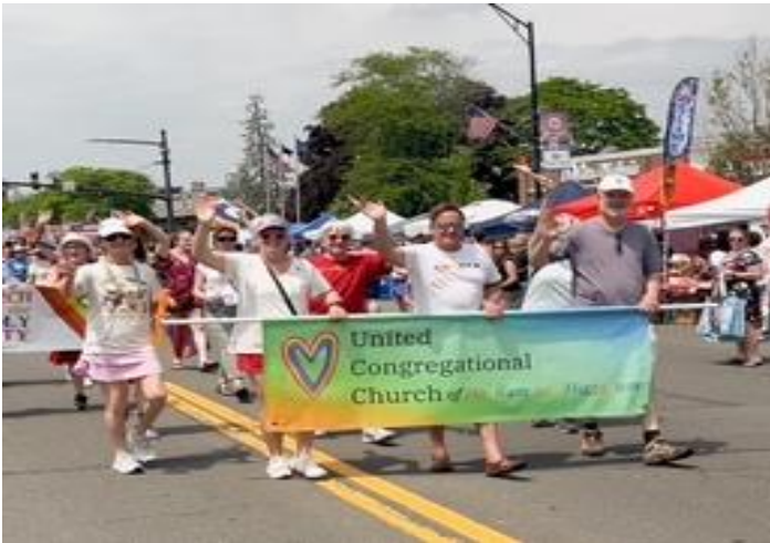
Middletown Pride Parade