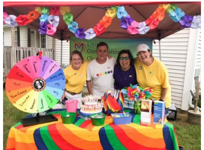
UCCHH HK Pride Booth