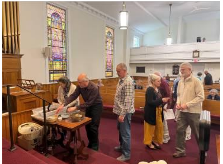
Earth Day Celebration