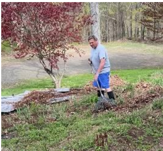
Spring Clean up