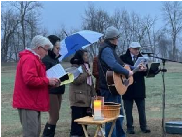
Easter Sunrise Service