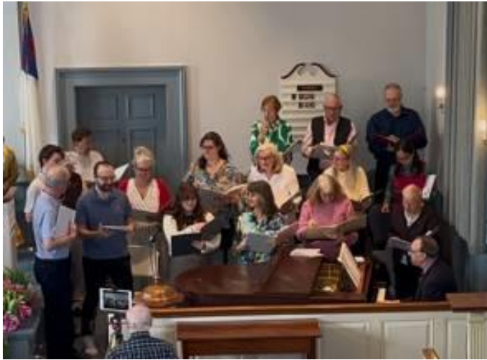
Click HERE to hear the choir