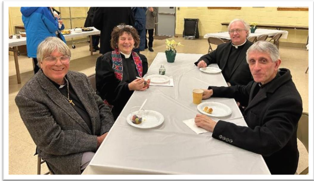
Town clergy enjoying fellowship after the Ecumenical Service of Prayer for Christian Unity held at St. Peter Church on January 22 nd .