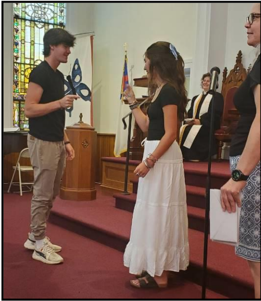
Celebrating our Graduates on June 16 th !