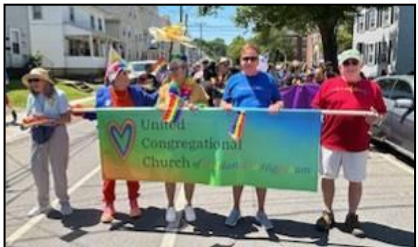
Pride Parade June 1 st