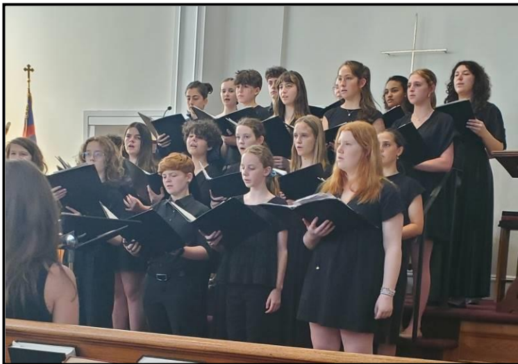
Coventry Choir Concert performed on May 28 th