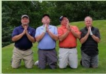
Photo Consent: photos taken at the event may be used for our website and social media. Please notify us if you wish to withhold your consent.

A portion of the proceeds will be donated in memory of Ron Booth to The First Tee of Connecticut. The First Tee was created to expose golf to underprivileged youth who might not normally have access to the game.