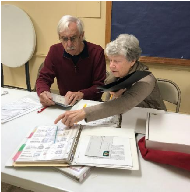
The members of the Memorial Garden Committee hard at work.