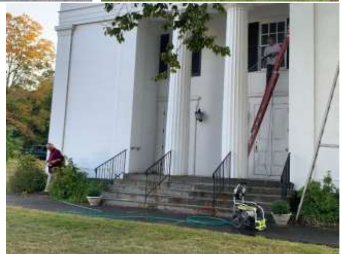
First Congregational Church of Haddam's Prudential Workday, Friday, September 25th